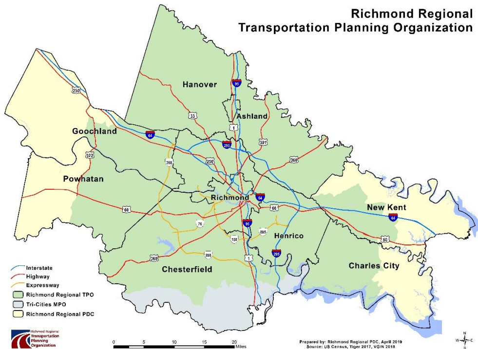
Figure 1. Richmond Regional Transportation Planning Organization